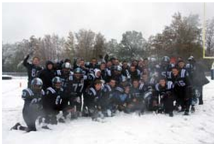
The Rye Neck Panthers Play their first "Snow Bowl!"