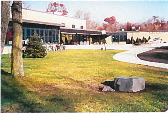
Park-like setting of the Middle/High School Campus