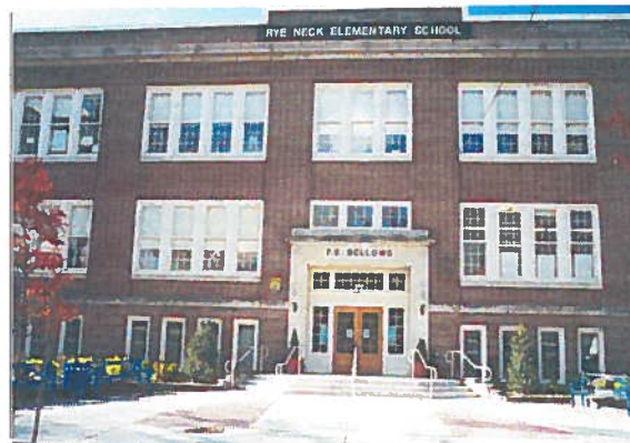
F.E. Bellows Elementary School