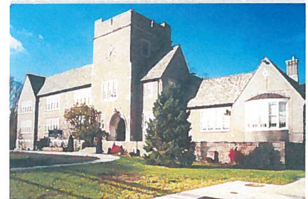
The Daniel Warren Elementary School