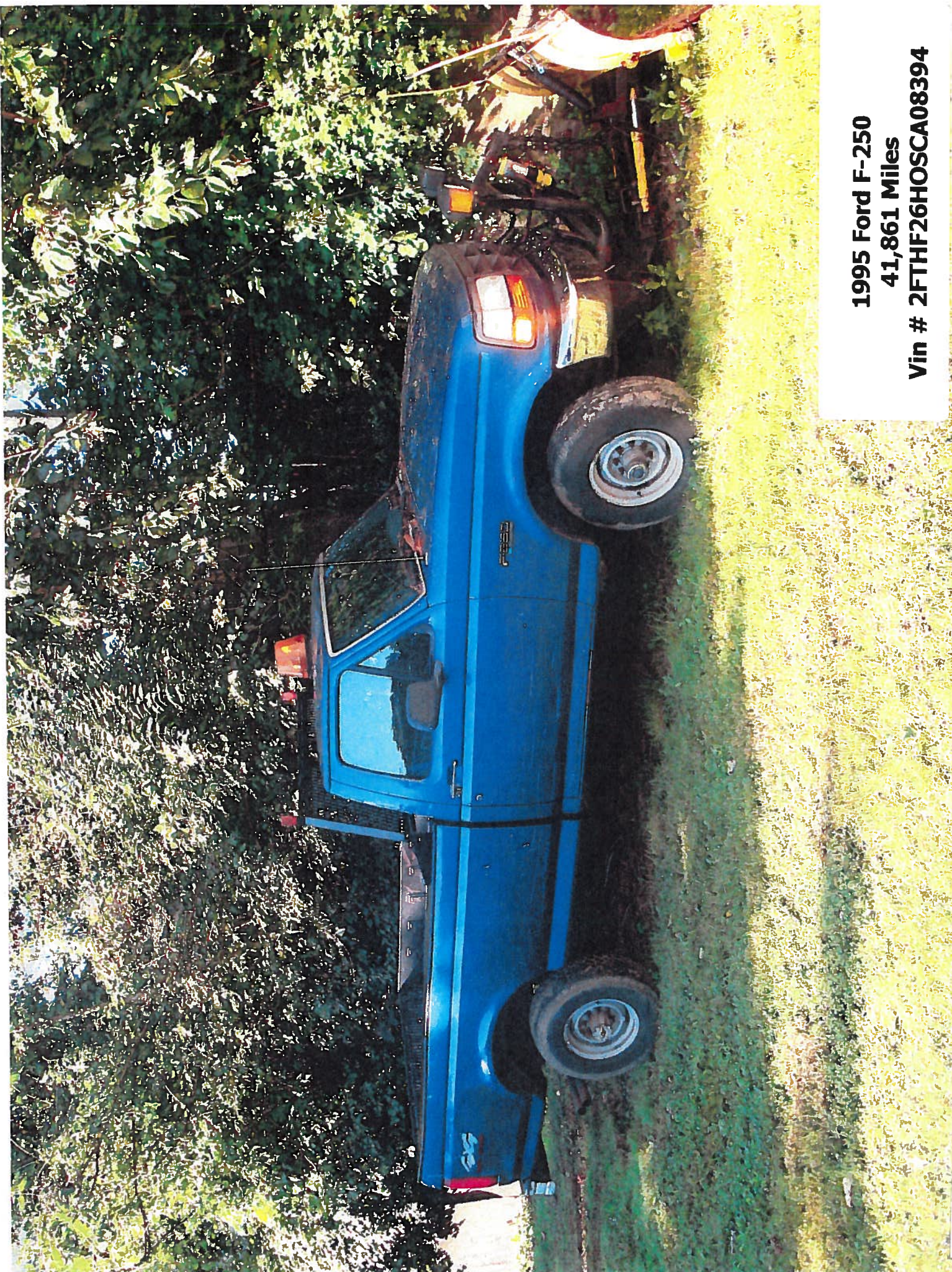
1995 Ford F-250 41,861 Miles Vin # 2FTHF26HOSCA08394