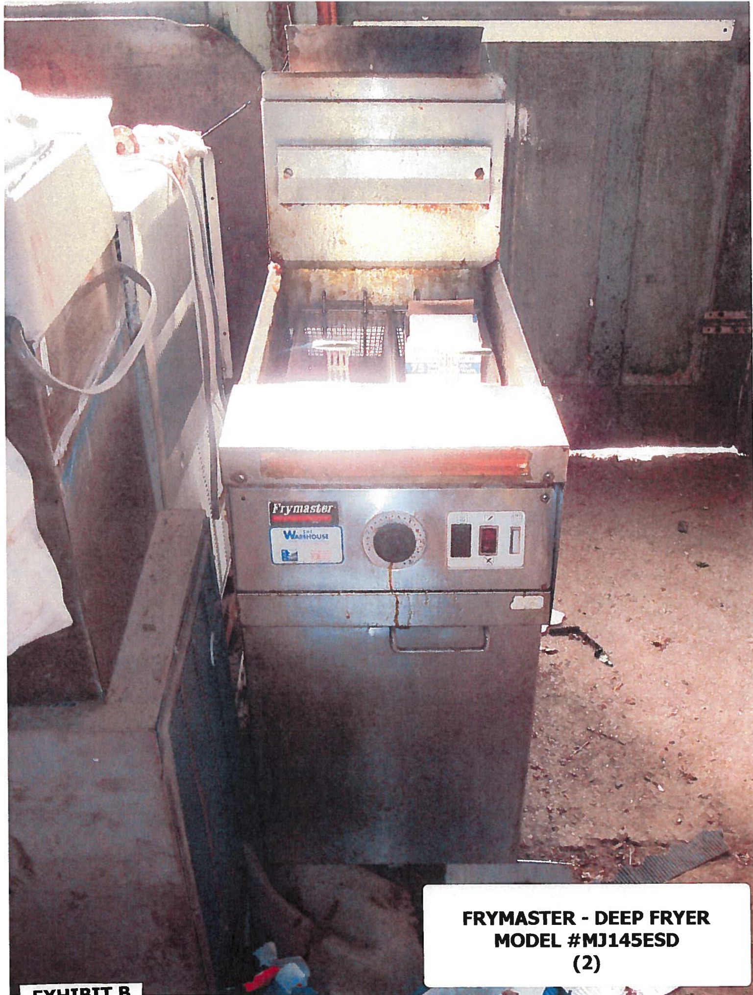
FRYMASTER - DEEP FRYER MODEL #MJ145ESD (2)